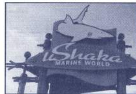
uShaka Marine World