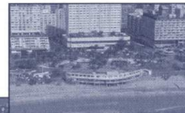
West Street Beach Before (left) and After (below)

The Durban beachfront got a major boost with the opening of the new West Street Beach facility at the beginning of December 2005, in time for the holiday season. This beach was opened up by the removal of the old Sea World and the realignment of the existing promenade at the bottom of West Street.